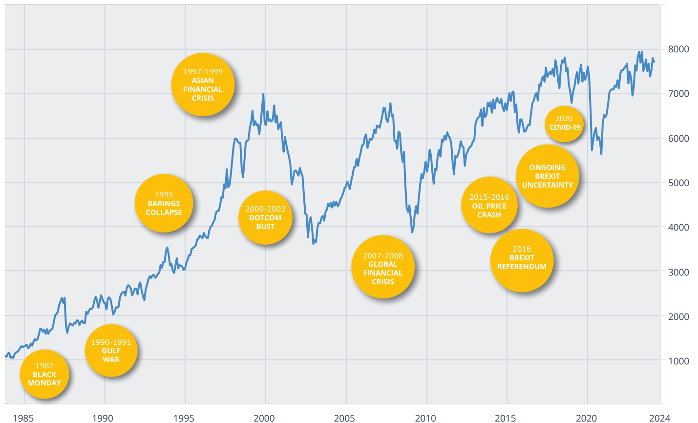
Chart: FTSE 100 since inception to January 2024

The value of investments can go down as well as up and you may not get back the full amount you invested. The past is not a guide to future performance and past performance may not necessarily be repeated.