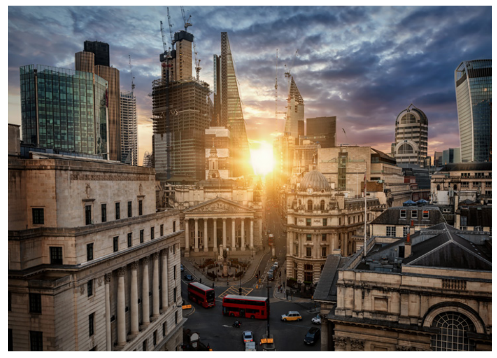
All details are correct at the time of writing (25 January 2024).

Financial advice and regular reviews are essential to help position your portfolio in line with your objectives and attitude to risk, and to develop a well-defined investment plan, tailored to your objectives and risk profile.