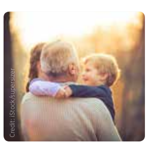
MAKING YOUR PLAN

How establishing LPAs can make things simpler for your loved ones